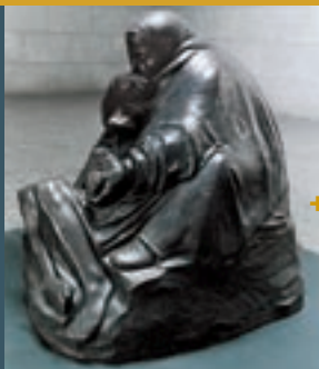
+ Käthe Kollwitz »Pietà«, 1936/1992 bronze, height 1,60 m Neue Wache, Berlin