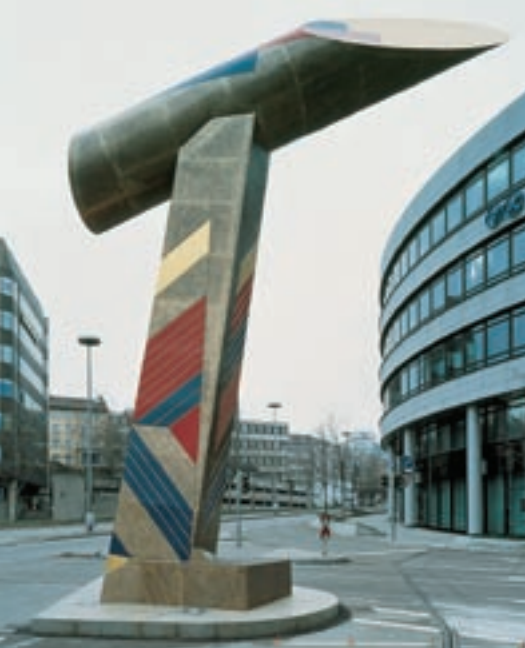
+ O.H.Hajek »Zeichen ortieren Orte«, 1999 bronze, height 10,9 m Sparabank, Stuttgart