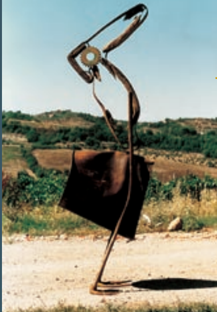
✦ Luciano Castelli »Große Ente«, 1990 bronze, height 2 m private ownership